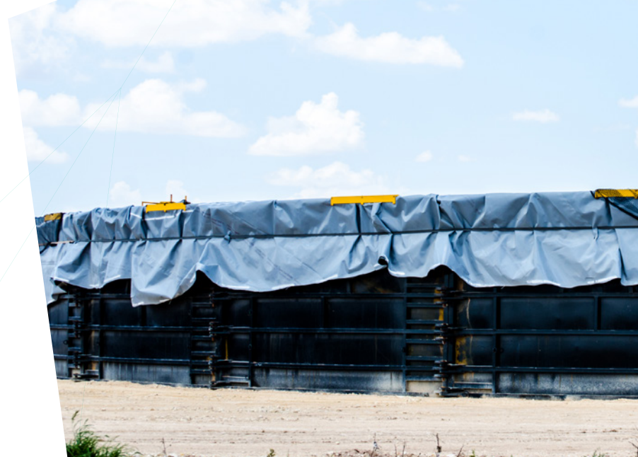
Figure 5: Select installed a network of aboveground storage tanks in close proximity to the Permian operations. The remote tank monitor units allowed the E&P company to monitor fluid levels, volume, and quality and efficiently schedule recharge, discharge, and clarification operations.

impaired water, of which 70% was flowback water from the operator's nearby leases. While every program is different and every situation warrants analysis, the advanced technologies implemented on this program and the partnerships between the E&P, Select, and the treatment group, kept the all-in, average price per barrel of treated water around $0.92.