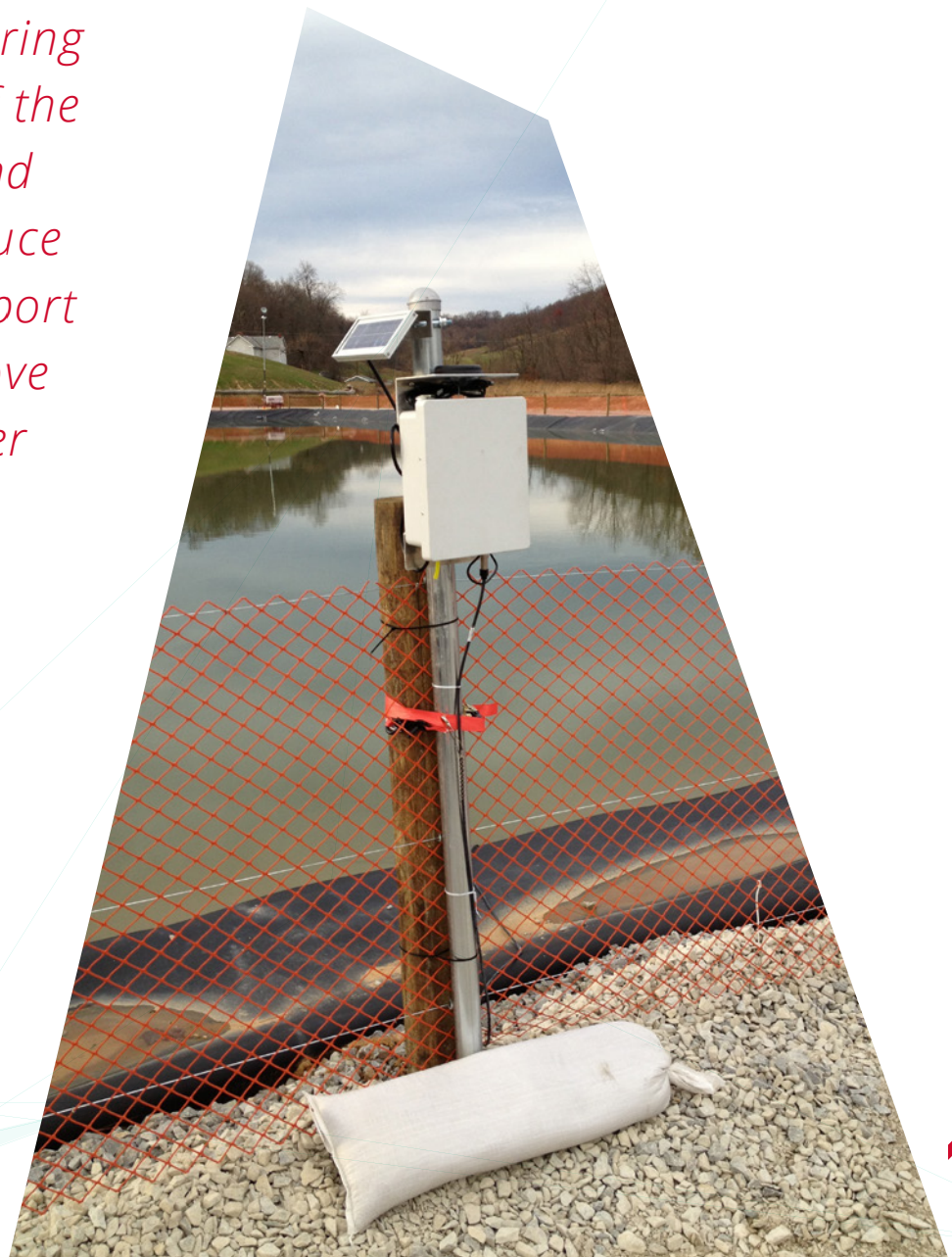
Figure 6: Remote units safely and remotely monitor water assets with a small on-site footprint. Each unit uses satellite connectivity to deliver information to operators as often as every 30 minutes.

Strategically deploying a state-of-the-art, remote monitoring system that takes advantage of the latest ruggedized electronics and industry best practices can reduce costs, improve efficiencies, support necessary reporting, and improve overall safety surrounding water management.