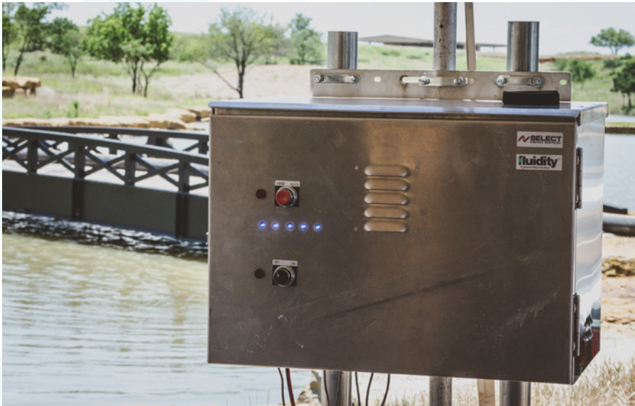
Figure 4: Leak detection units add an extra layer of security to tank monitors. Each section of an aboveground storage tank corresponds to a blue light on the leak detection unit, allowing operators to pinpoint the exact location of a leak. The unit is capable of alerting employees on-site with alarms and lights as well as sending remote alerts to employees via text message or email.