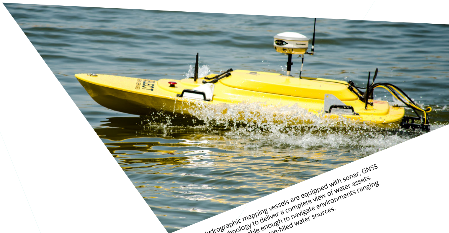
Figure 1: Hydrographic mapping vessels are equipped with sonar, GNSS and compass technology to deliver a complete view of water assets. It's also strong and nimble enough to navigate environments ranging from flowback pits to tight tree-filled water sources.

By combining these AquaView® components, Select and the operator determined that the frac pits in question held significantly less volume than the engineered designs outlined.